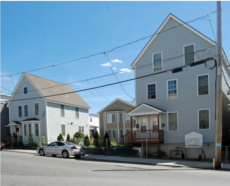
New Habitat for Humanity homes on Market Street in Lawrence, MA

Project teams are assembled at the job site and are led by volunteers that have experience in the assigned task. Habitat project managers are always available to assist with each team to insure the task is done correctly.