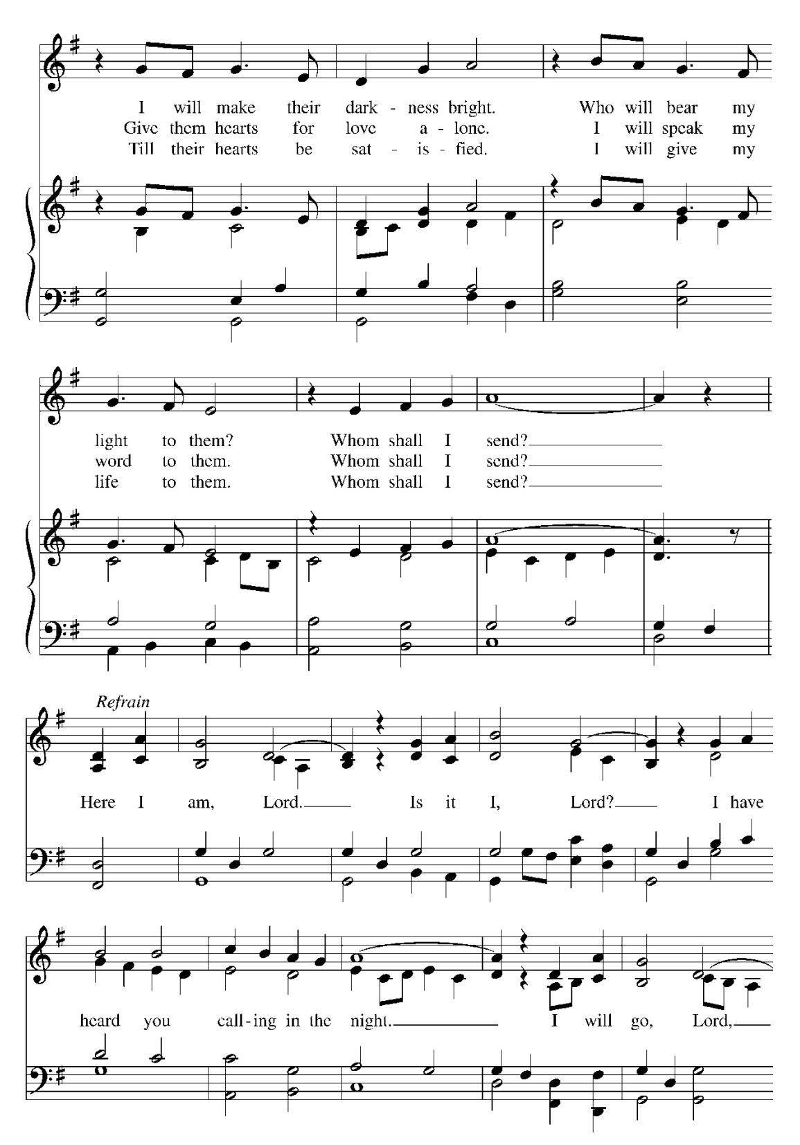
Continued next page