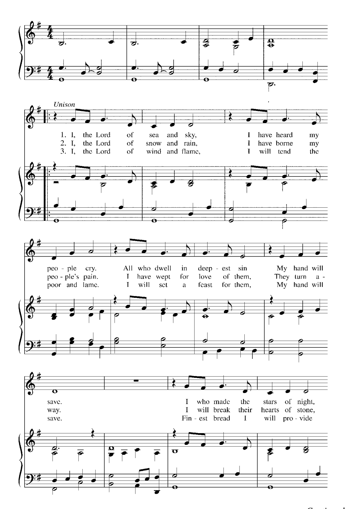
Continued next page