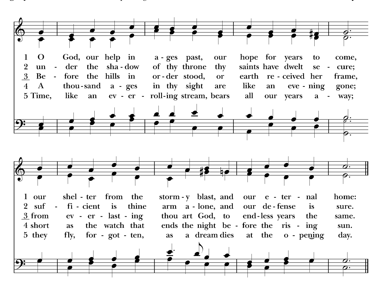
6 O God, our help in ages past, our hope for years to come,