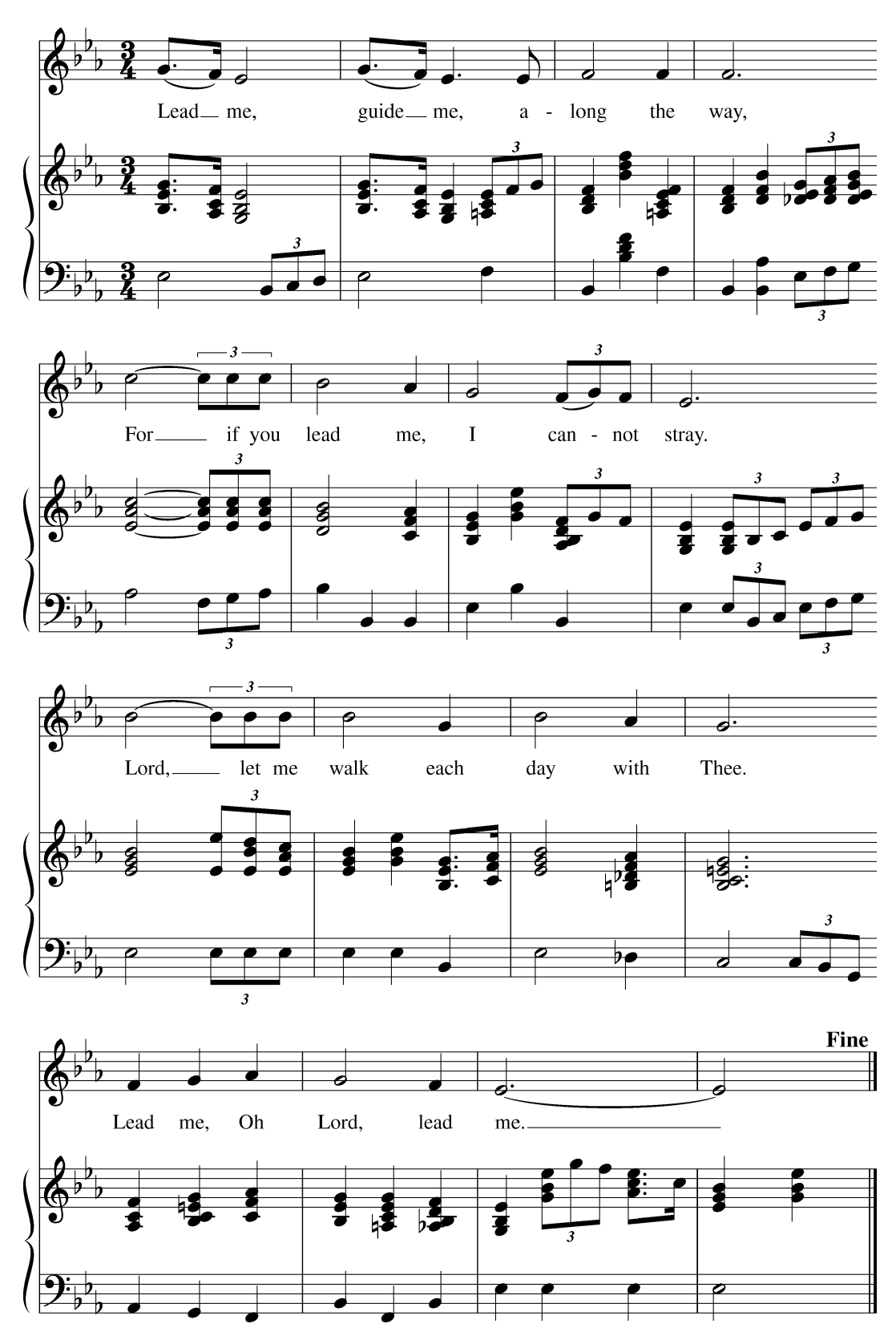
Continued next page