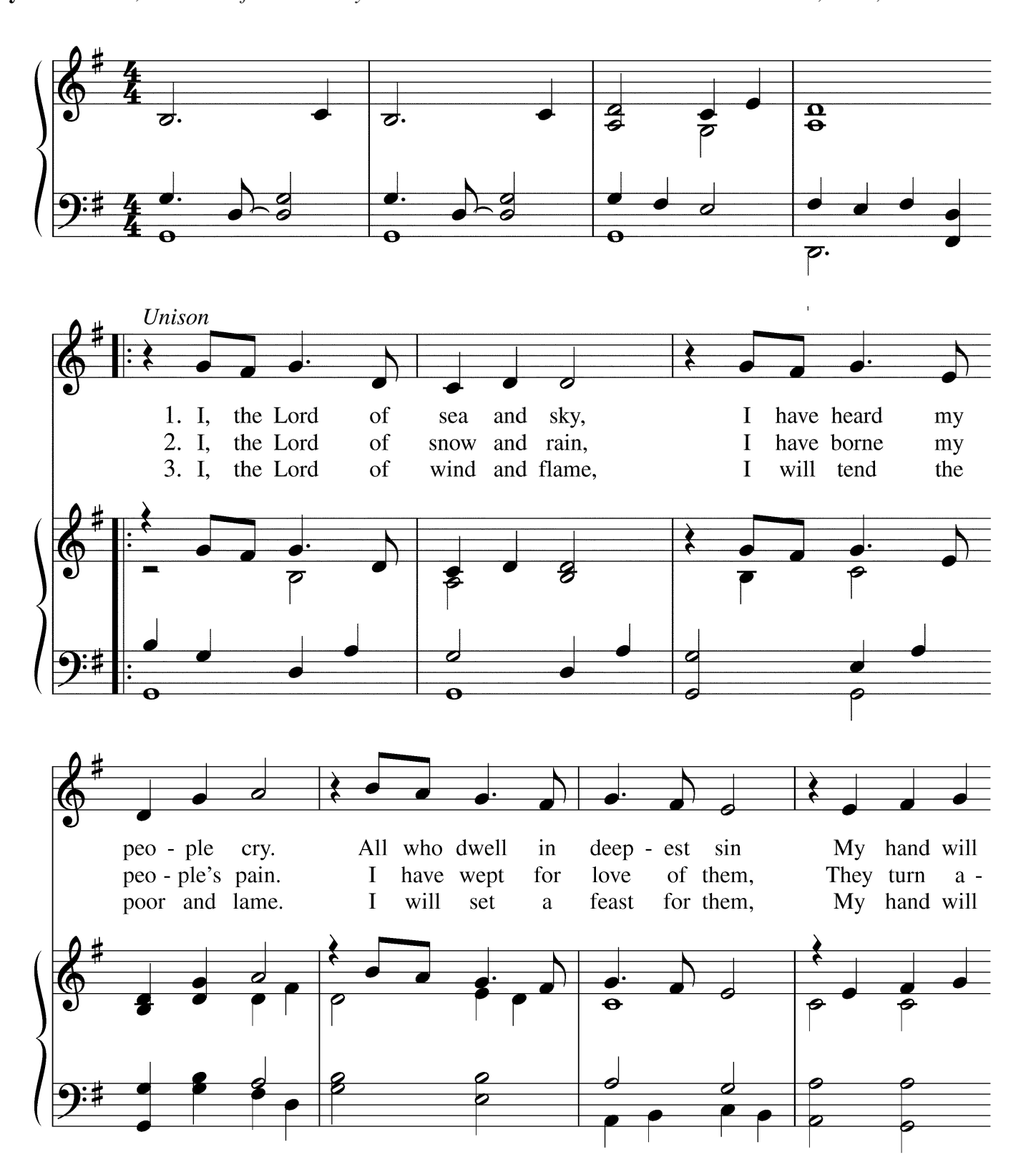
continued next page